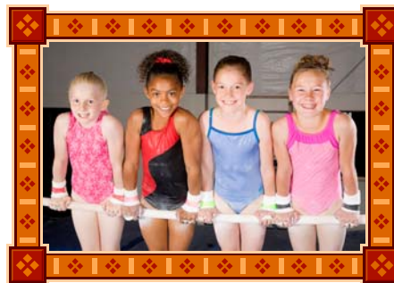
Which stands out?

You may want to "mat" or frame your photo. It is the same principle as framing a picture you would hang on the wall. By placing an additional layer of paper or card stock around your photo it will make it stand out and look more professional.