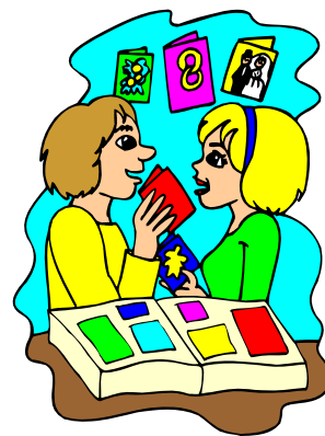
Photo quality will NOT be a factor in judging. Try to use good photographs; however this is NOT the photography project. Be creative—all work should be your own. Be sure materials you use are safe for your photos. Do not use ball-point pens and/or pencils, crayons, markers, magnetic albums, construction paper, or any adhesives that are not photo safe.

Keep in mind the proper placement of photos, etc. in your album. Your scrapbook is telling a story. Use chronology (putting things in order of occurrence) and/or themes to organize your scrapbook.