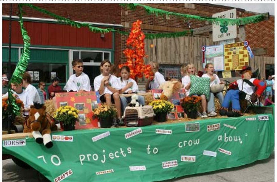
The Cass Merrymakers 4-H Club participated in the Scarecrow Fest parade and received a trophy for "Patches Choice." Congratulations!